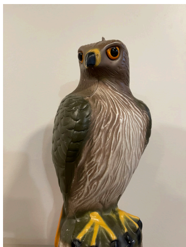
Ideas for concealment solutions (owl not included).