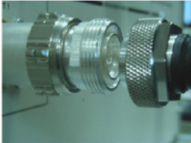
Figure 2. Align connectors for interface

Next, carefully but firmly push the male 7-16 end of the device or adapter straight into the female 7-16 receptacle of the connector saver.