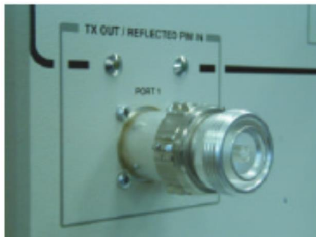
Figure 1. Front panel 7-16 connector with connector saver

With the connector savers attached to the front panel, perform a careful inspection of the connector saver and if necessary, blowout or clean any particulate matter out of the connector.