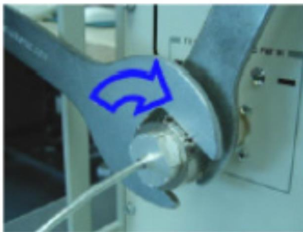
Figure 4. Placement of wrenches and tightening of connector