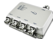
This picture is showing MI-50501