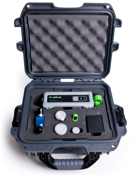
A single case can accommodate 1x iVA, 1x OSL and 1x adaptor kit