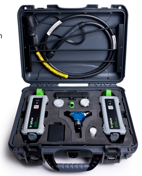
Twin case can accommodate 2x iVA, 1x OSL, 1x adaptor kit, 1x phase stable cable and battery bank