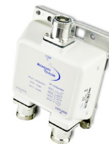
*This photo is showing MI-24103

The MI-241nn family of cavity diplexer products, include: